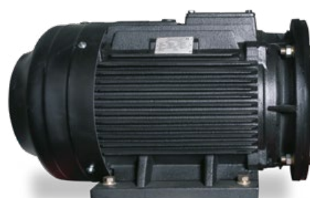
Permanent magnet motor